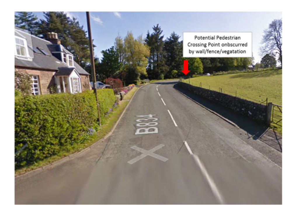
Figure 3.1: Obscured Crossing Point

3.6 Also, the alternative Auditor recommendation for a crossing point to the south side of Station Road for westbound pedestrians is puzzling given that the footway stops opposite Gartness Road and therefore pedestrians then have to walk on the main road. This future desire line is credible given that during a site visit it was noted that school children use Endrick Road and then a core path to access Killearn Primary School. It can therefore be concluded that there is not a continuous footway between the development site and the already established Endrick Road primary school route. The Endrick Road route is in fact slightly shorter than via Balfron Road.