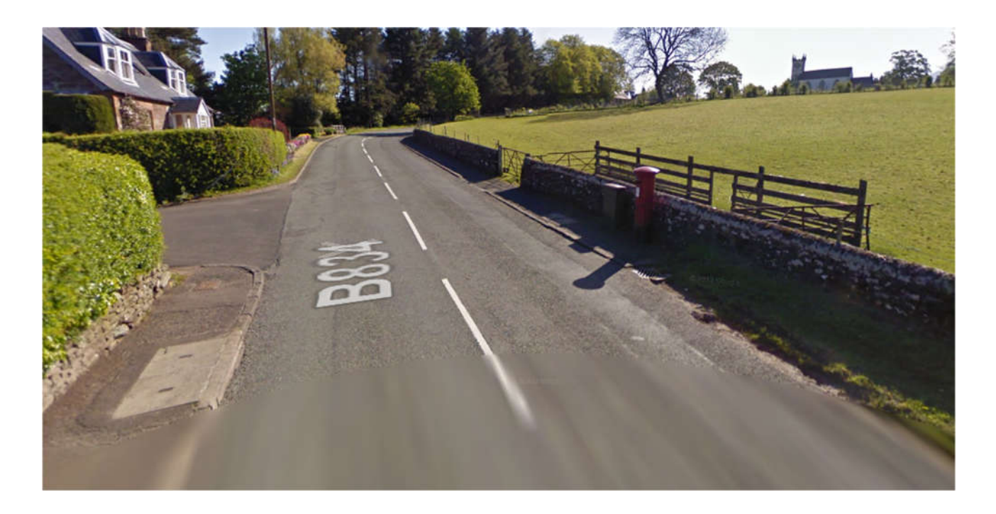
Figure 2.1: Intermittent Footways Both Sides of Station Road

2.9 It is then clear that the TS has not considered a number of issues and that because of the "intermittent" provision of footways along Station Road pedestrian crossing movements will be necessary at various locations. This lack of connectivity is contrary to various planning policy objectives set out in, for example, Designing Places, Designing Streets and Stirling Council's SG14 "Ensuring A Choice of Access" – some of these objectives are set out in Chapter 3 of the TS.