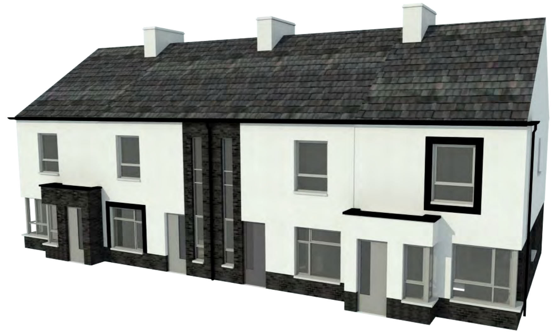
HUGHES AND SALMON HOUSETYPES 2/3 Bed Semi-Detached/Terraced 70.9 Sq. m / 760 Sq. ft

Following a detailed analysis of the local vernacular in terms of both finishes and massing, the proposed housetypes shown here have been developed specifically for this project. They have been designed to reflect the character of the existing settlement through the use of a carefully selected palette of materials and the incorporation of close clipped eaves, slate effect roofs and gable chimneys, together with windows with a vertical emphasis.