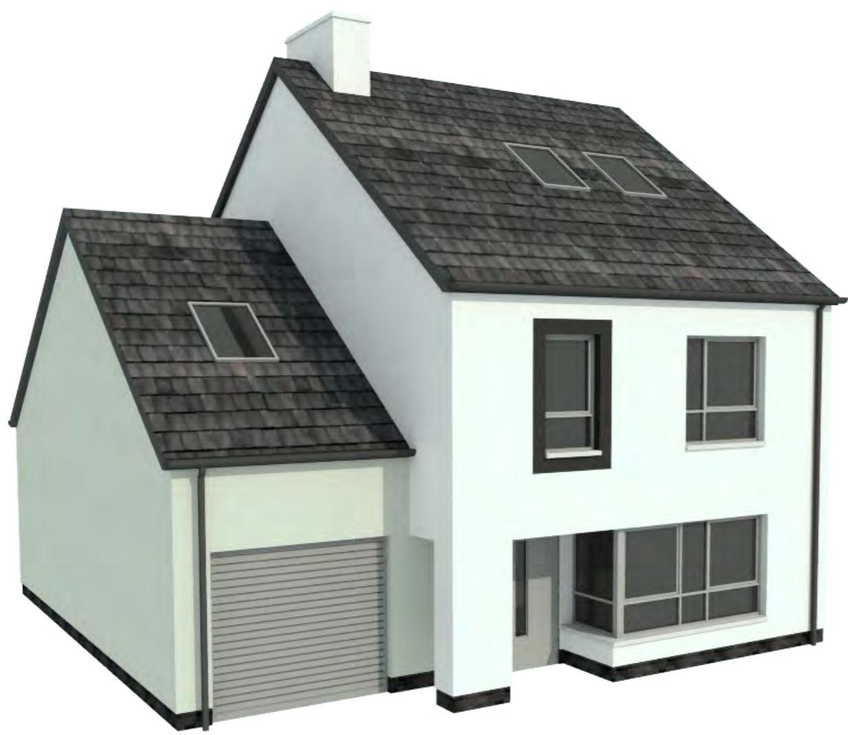
ADAM HOUSETYPE 4 Bed Detached 155 Sq. m / 1,660 Sq. ft