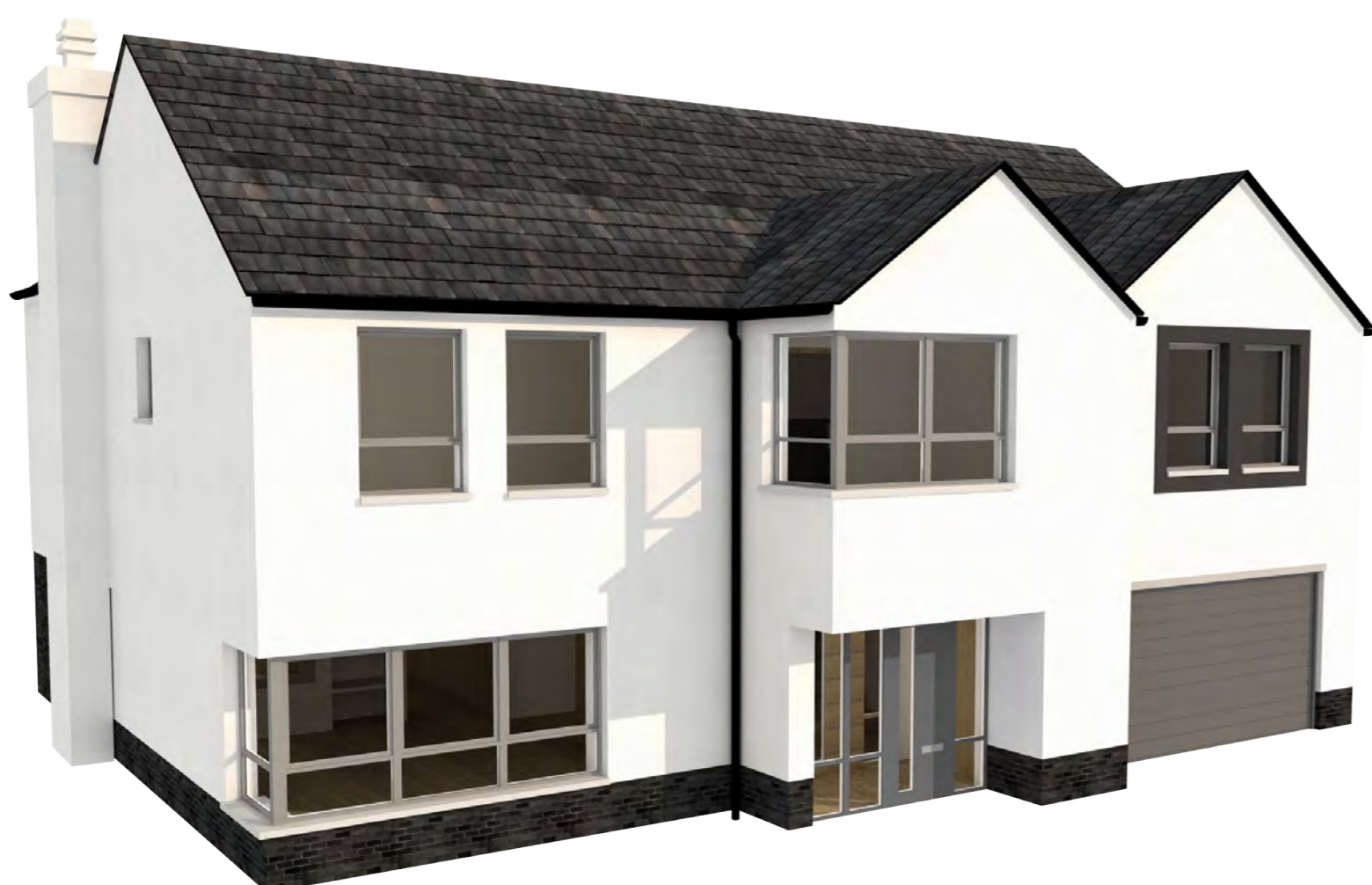
SPENCE HOUSETYPE 5 Bed Detached 269 Sq. m / 2,900 Sq. ft