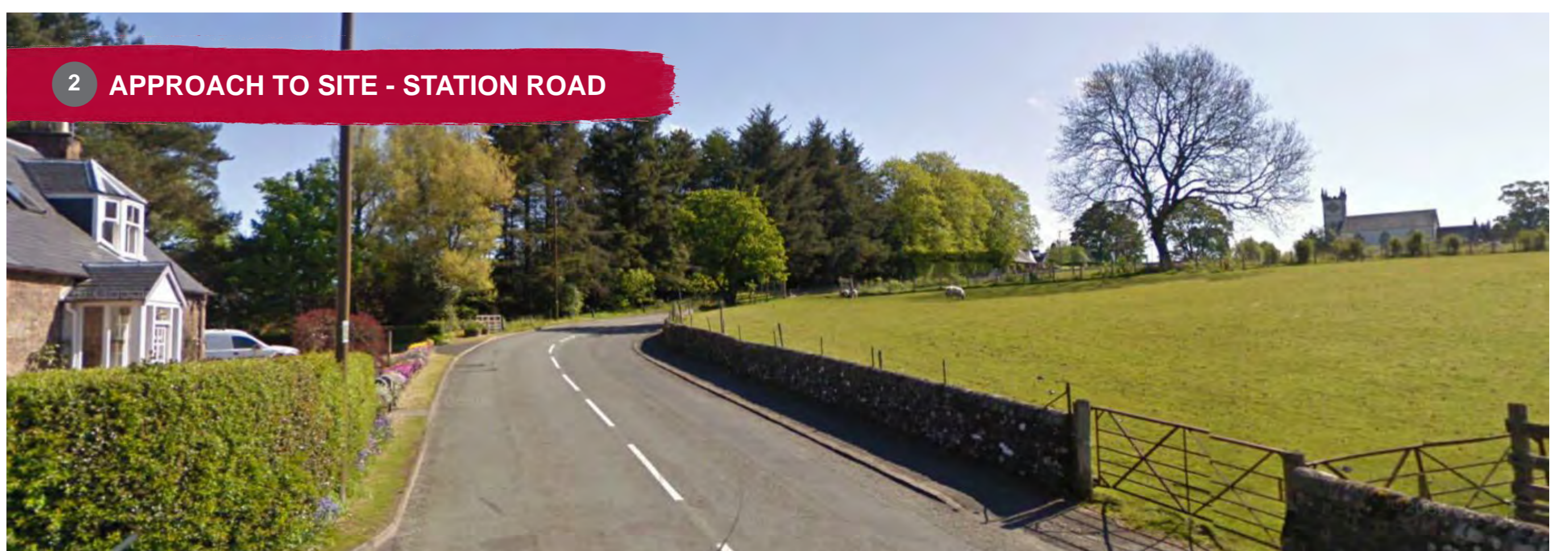
2 APPROACH TO SITE - STATION ROAD

The Station Road development shall respond to the needs of the local community, and offer homes that respect the local context of the village, landscape and topography.