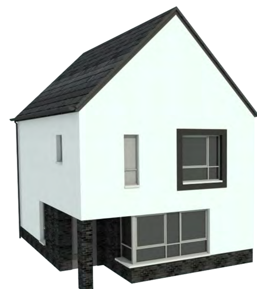
BRYCE HOUSETYPE 3 Bed Detached 103 Sq. m / 1,100 Sq. ft