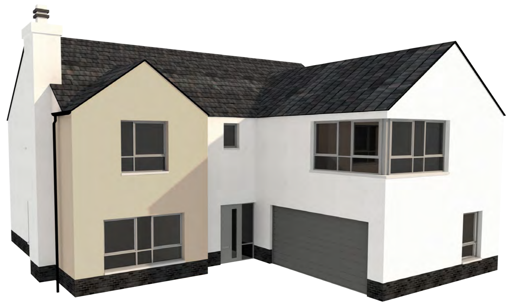
LORIMER HOUSETYPE 5 Bed Detached 278 Sq. m / 2,990 Sq. f